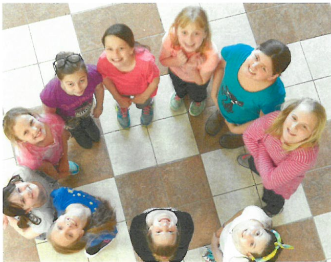
Photo: Cast members taking a break just before their May 5 th performance of "Let's Eat!" in the Gateway Performing Arts Center.

Healthy Stress Management: Students at Chester Elementary School received hands-on strategies to manage stress, including dance, mosaics and other art mediums, mindfulness, Heartmath, affirmations, visualization, yoga and Tai Chi. ($600)