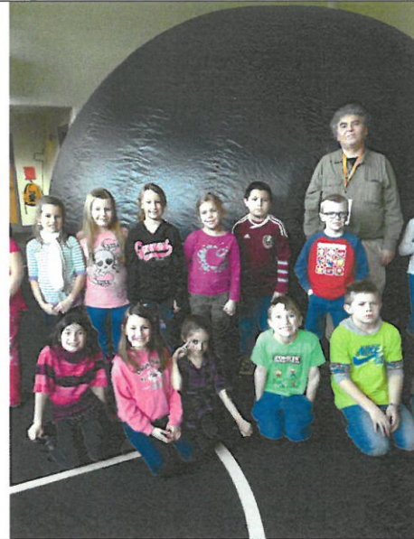
Photo: Second graders waiting to enter StarLab and continue their study of constellations and planets.

Healthy Stress Management: Students at Chester Elementary School received hands-on strategies to manage stress, including dance, mosaics and other art mediums, mindfulness, Heartmath, affirmations, visualization, yoga and Tai Chi. ($600)